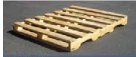
PRODUCTION JDE CODE: 032 - STACK 4 HIGH