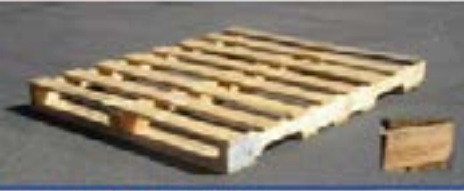
HEAT TREATED BLOCK JDE CODE: 031 - STACK 4 HIGH