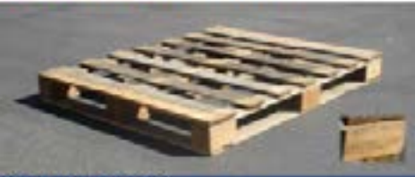
YELLOW BLOCK JDE CODE: 046 - STACK 4 HIGH