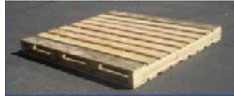
4-WAY BLOCK (NOT HEAT TREATED) JDE CODE: 033 - STACK 4 HIGH