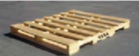
USDA JDE CODE: 042 - STACK 3 HIGH