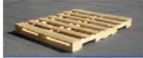
HARDWOOD (RECONDITIONED #1) JDE CODE: 010 - STACK 3 HIGH