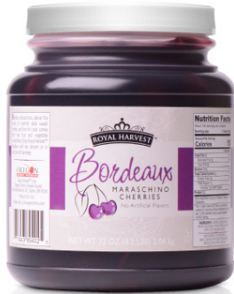
Bordeaux Cherries available stem-on or plain

Grown along the Columbia River Gorge, Bordeaux is an Oregon-born dark sweet cherry, hand-picked at the peak of ripeness to deliver the most satisfying experience