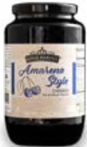
Amarena Style Cherries plain, stemless